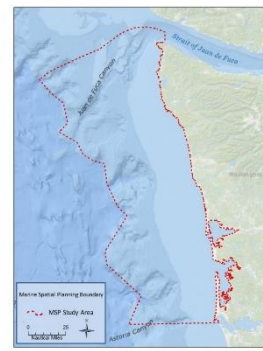
Washington's Marine Spatial Planning Study Area.

Marxan is a decision-support tool, but does not provide outputs that are 'the answer'. Instead, the model can inform the many potential solutions for a planning process to consider. In the case of marine spatial planning, the model can highlight a variety of solutions that avoid highly used areas and sensitive areas.